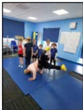
Break Dancing Club